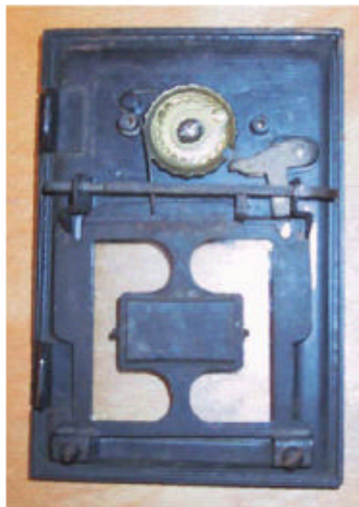
Mail Box Door Inside Cover Removed