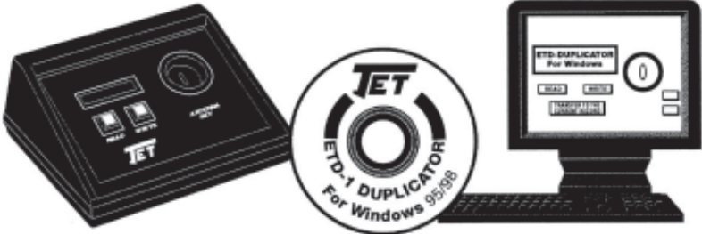
ETD-1 Duplicator and Software

Details and Specifications in Catalog 602 and www.jetkeys.com