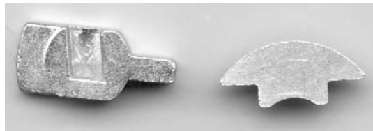
Locking Bar #8 Page 31 Retainer Plate #5 Page 31

X001 242421 X002 242443 X003 311324 X004 113134 X005 423244 X006 442334 X007 243134 X008 112331 X009 132313 X0010 344234 X0011 131212 X0012 242324 X0013 134342 X0014 132442 X0015 313443 X0016 224224 X0017 133242 X0018 131222 X0019 112442 X0020 131344