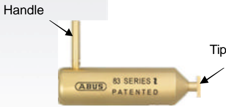
83 S2 Premium Shackle Change Tool Part # 83414A

Change a shackle in seconds with ABUS Patented "QUICK SHACKLE CHANGE" Simply use the NEW ABUS shackle change tool