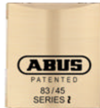
83/34 S2 w/o Shackle Part # 83351