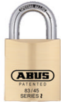
83/45 S2 with Shackle Part # 83638